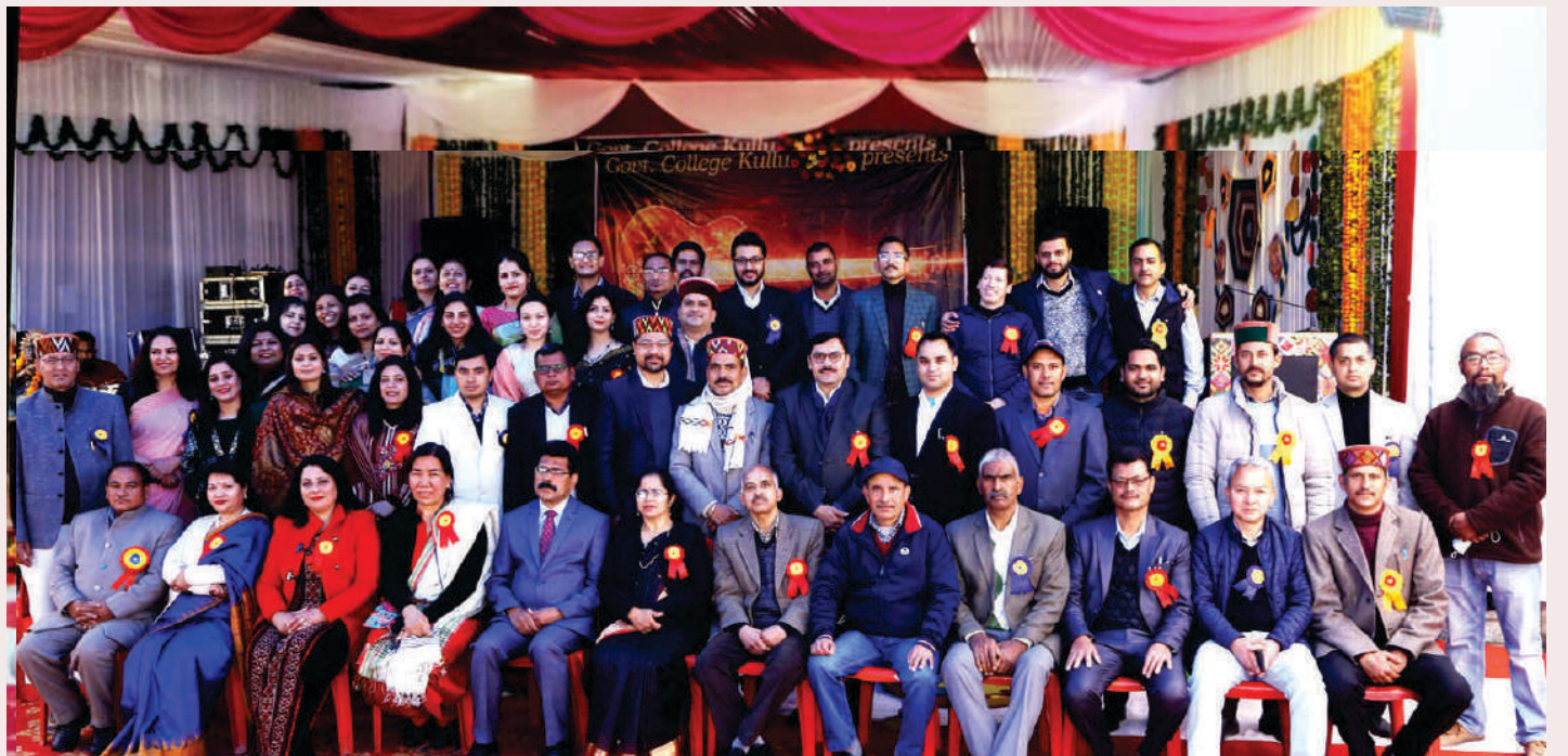
Teaching Staff of G.C Kullu