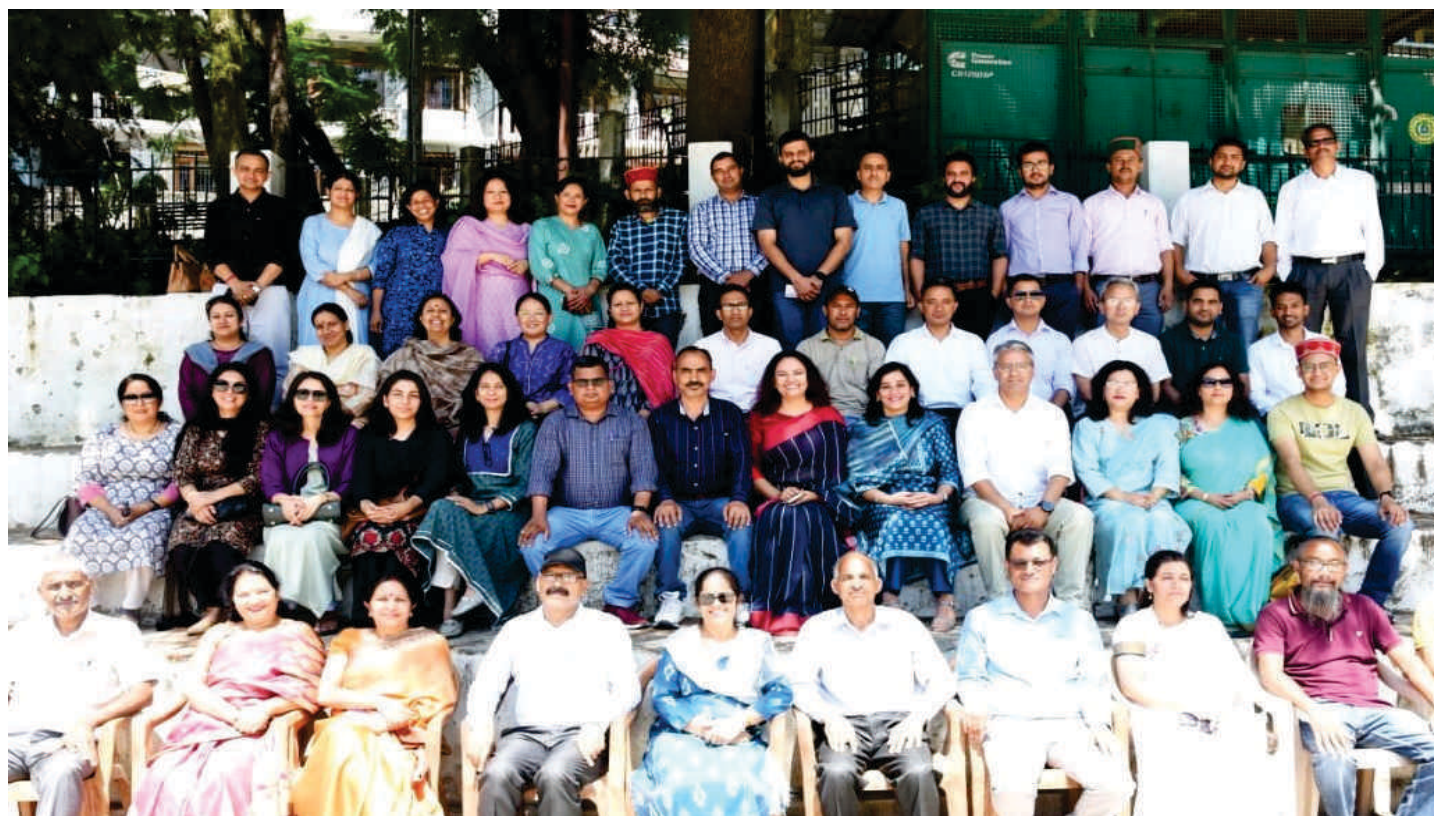
Teaching Staff of G.C Kullu