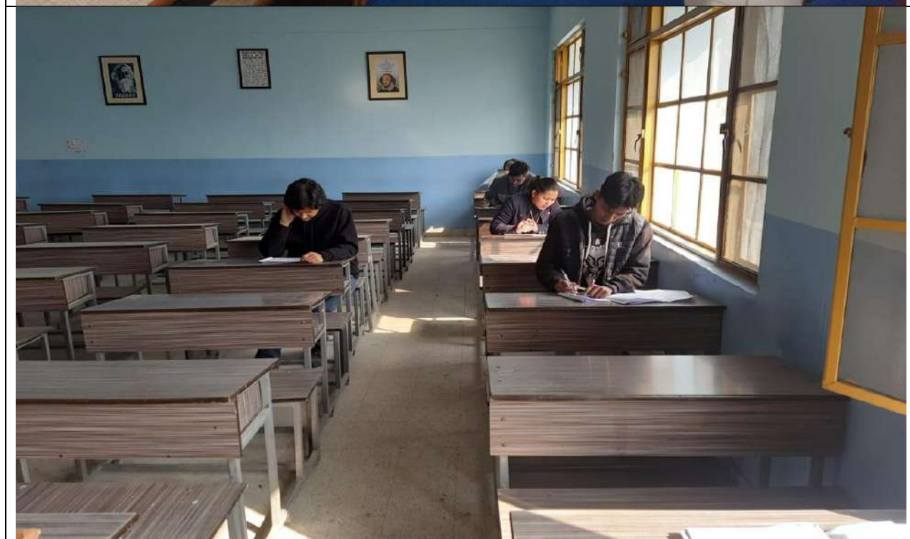
Extra Classes for Meritorious Students