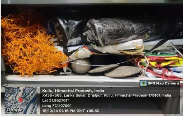
GPS Map Camera Kullu, Himachal Pradesh, India X436+568, Lanka Bekar, Dhalpur, Kullu, Himachal Pradesh 175101, India Lat 31.952761° Long 77.110706° 15/10/24 01:16 PM GMT +05:30