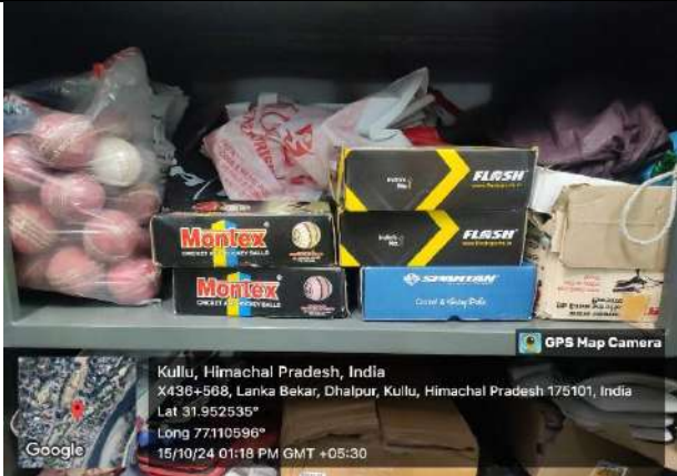
GPS Map Camera Kullu, Himachal Pradesh, India X436+568, Lanka Bekar, Dhalpur, Kullu, Himachal Pradesh 175101, India Lat 31.952535° Long 77.110596° 15/10/24 01:18 PM GMT +05:30