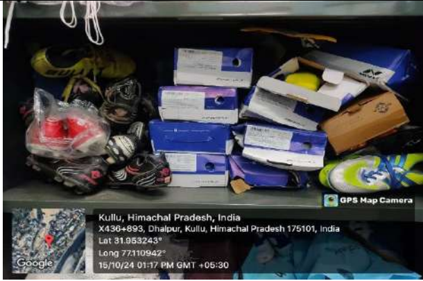
GPS Map Camera Kullu, Himachal Pradesh, India X436+893, Dhalpur, Kullu, Himachal Pradesh 175101, India Lat 31.953243° Long 77.110942° 15/10/24 01:17 PM GMT +05:30