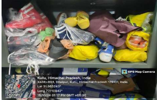
GPS Map Camera Kullu, Himachal Pradesh, India X436+893, Dhalpur, Kullu, Himachal Pradesh 175101, India Lat 31.953243° Long 77.110942° 15/10/24 01:17 PM GMT +05:30