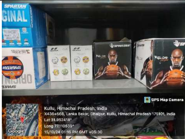
GPS Map Camera Kullu, Himachal Pradesh, India X436+568, Lanka Bekar, Dhalpur, Kullu, Himachal Pradesh 175101, India Lat 31.952418° Long 77.110539° 15/10/24 01:16 PM GMT +05:30