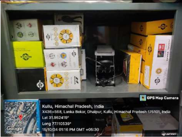
GPS Map Camera Kullu, Himachal Pradesh, India X436+568, Lanka Bekar, Dhalpur, Kullu, Himachal Pradesh 175101, India Lat 31.952419° Long 77.110539° 15/10/24 01:16 PM GMT +05:30