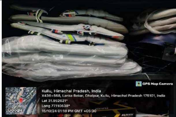
GPS Map Camera Kullu, Himachal Pradesh, India X436+568, Lanka Bekar, Dhalpur, Kullu, Himachal Pradesh 175101, India Lat 31.952621° Long 77.110638° 15/10/24 01:18 PM GMT +05:30