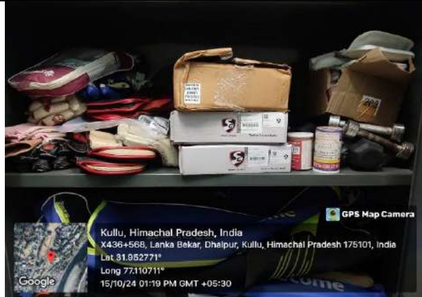
GPS Map Camera Kullu, Himachal Pradesh, India X436+568, Lanka Bekar, Dhalpur, Kullu, Himachal Pradesh 175101, India Lat 31.952771° Long 77.110711° 15/10/24 01:19 PM GMT +05:30