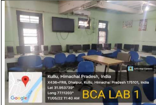
BCA Lab 1- 20 computers