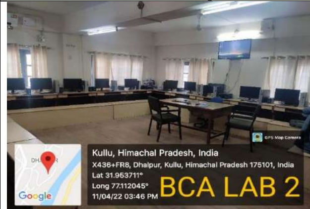
BCA Lab 2- 20 computers