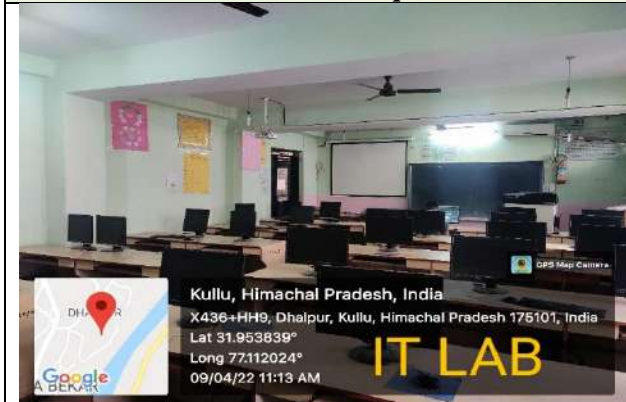
IT Lab- 30 computers