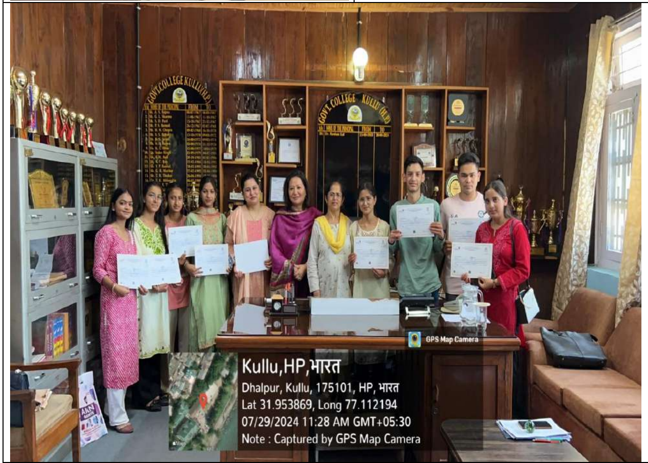
Kullu, HP, भारत Dhaulpur, Kullu, 175101, HP, भारत Lat 31.953869, Long 77.112194 07/29/2024 11:28 AM GMT+05:30 Note : Captured by GPS Map Camera