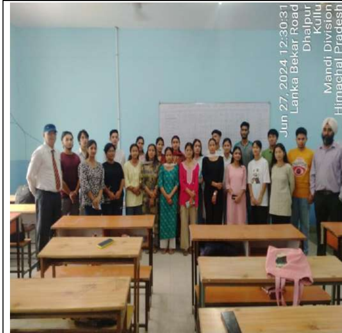
Jun 27, 2024 12:30:31 Dhaulpur Lanka Bekar Road Kullu Mandi Division Himachal Pradesh